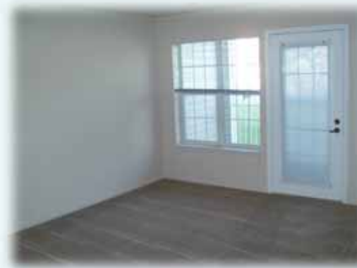
Statewide Disaster Restoration: 2010 Submission