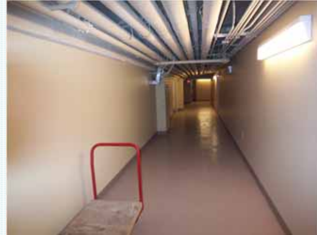
Belfor: Valentine Theatre