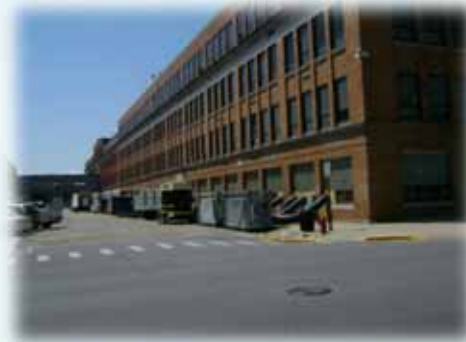
Platinum Restoration: 2010 Submission