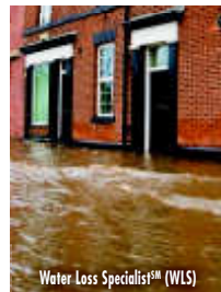
Water Loss Specialist SM (WLS)