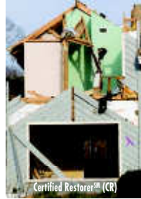
Certified Restorer SM (CR)