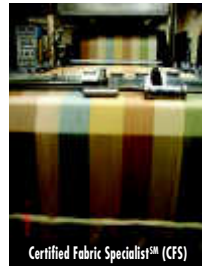
Certified Fabric Specialist SM (CFS)