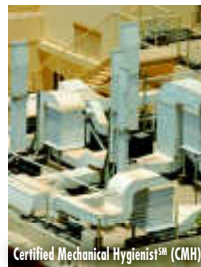
Certified Mechanical Hygienist SM (CMH)