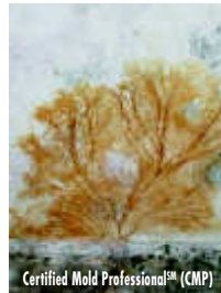
Certified Mold Professional SM (CMP)